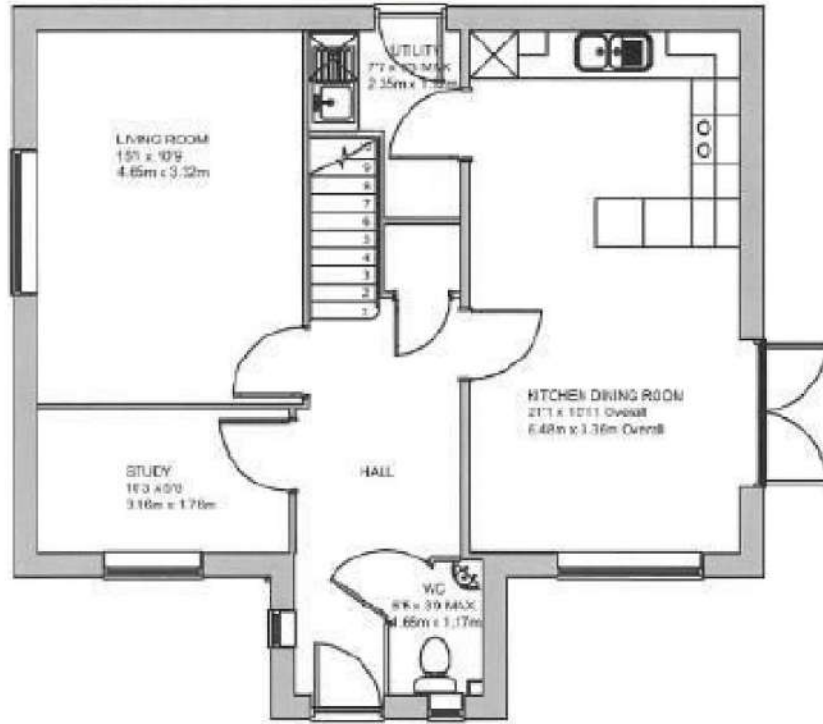
GROUND FLOOR APPROX. FLOOR AREA 656 SQ.FT. (62 SQ.M)